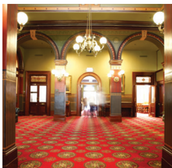
Legislative Assembly foyer

The Legislative Assembly chamber is Australia's oldest legislative chamber. Originally built for the Legislative Council in 1843, it has been used continuously by the Legislative Assembly since it was created in 1856 when the bicameral (two houses) parliamentary system was introduced. In the early 1980s the chamber was restored to its 1908 appearance.