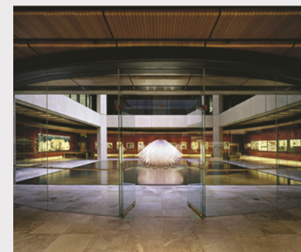
The Fountain Court

The Fountain Court features a central water sculpture by Robert Woodward. In the surrounding area temporary displays of artwork and items of historical and cultural interest are always on public view.