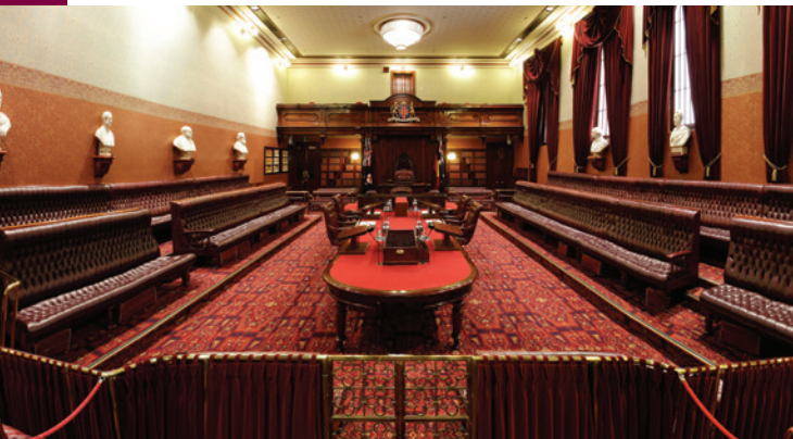
Legislative Council chamber