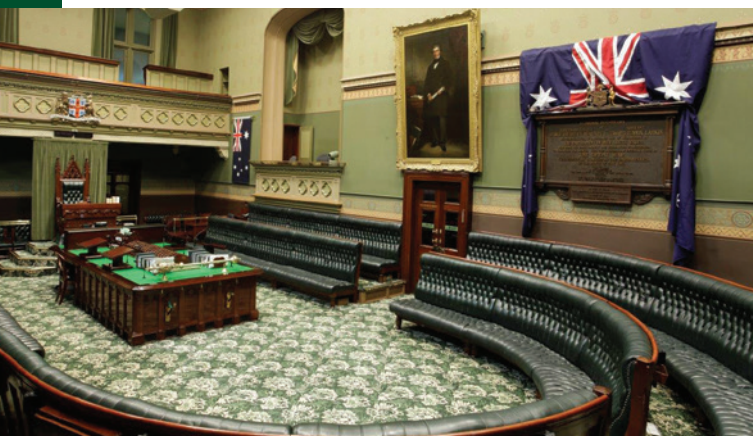
Legislative Assembly chamber

The Legislative Assembly chamber is Australia's oldest legislative chamber. Originally built for the Legislative Council in 1843, it has been used continuously by the Legislative Assembly since it was created in 1856 when the bicameral (two houses) parliamentary system was introduced. In the early 1980s the chamber was restored to its 1908 appearance.