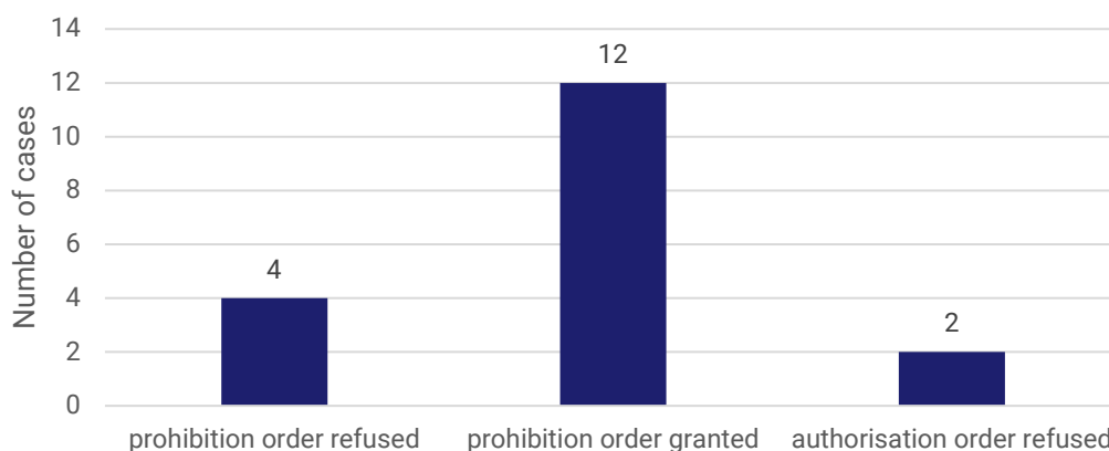
Figure 2: Outcome of applications made under Part 4 Summary Offences Act 1988, between 1 January 2003 and 14 November 2023

Of the 16 applications for prohibition orders made by the Commissioner of Police, 12 (75%) were successful and resulted in the court granting a prohibition order. Of the 2 applications for authorisation orders, both (100%) were unsuccessful and resulted in the court refusing to grant an authorisation order.